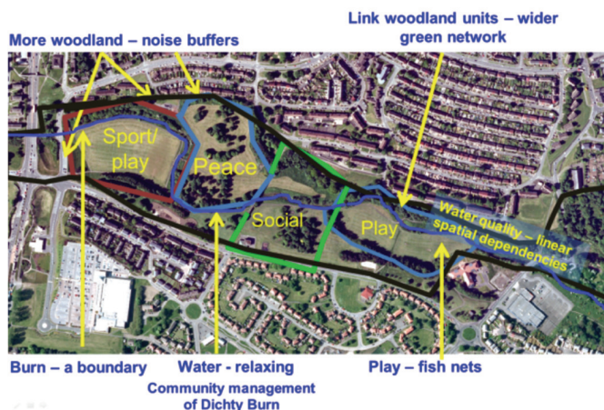
Figure 2: Example spatial plan for park and adjacent area derived from engagement events.

The geographic distribution of features identified in the engagement sessions led to the mapping of alternative options and associations of key functions within the park. An example is shown in Figure 2. Some of the factors identified by audiences are highlighted, such as more trees along certain edges, or infilling of gaps, and potential functions of sub-areas of the green space.