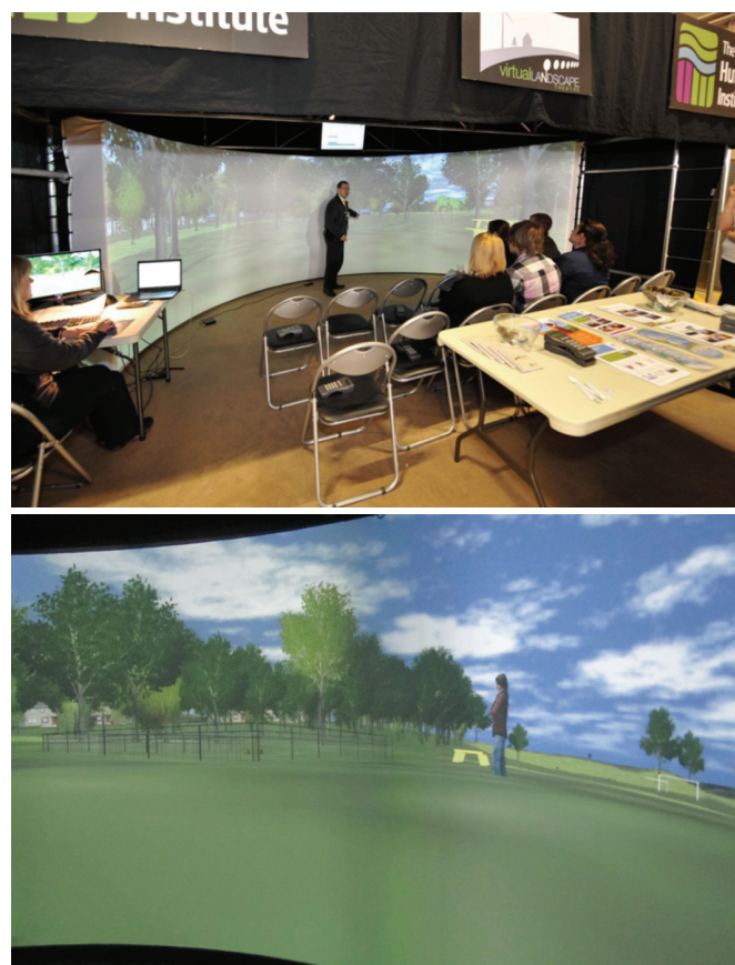
Figure 1: Eliciting public opinions on current and alternative future uses of Finlathen Park, Dundee, in the Virtual Landscape Theatre.

Audiences were invited to prioritise topics (e.g. woodland, access, facilities transport, lighting, etc.), and then select individual types of feature to locate in the park. Subsequent discussions of opinions within the group identified options for park management and layout or content which might increase use or other benefits (e.g. personal health, biodiversity, water quality in the burn and social space for different age groups).